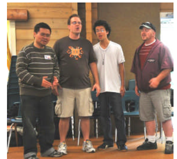
West Coast Fusion