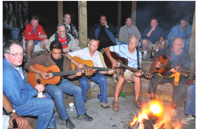
GoF Fireside Band & Chorus