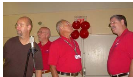
Catch Those Overtones