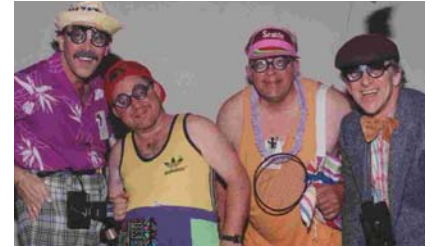
One Man Short