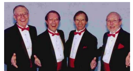
The Music Men

The chorus placed first in Divisional and the line up of quartets was very satisfactory with 3 in the top 10, The Edge, Speak Easy and One Man Short . At District in