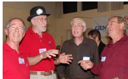
Oldsters (Jim Dandies)