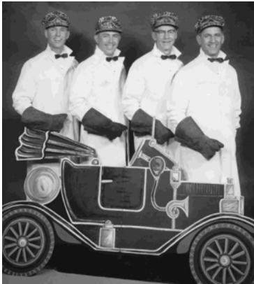
Model T Four

This is the eighth in our 50 year history synopsis.