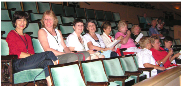
Some of the GoF Support Group

As for our performance, I left the stage feeling that we couldn't have done any better!