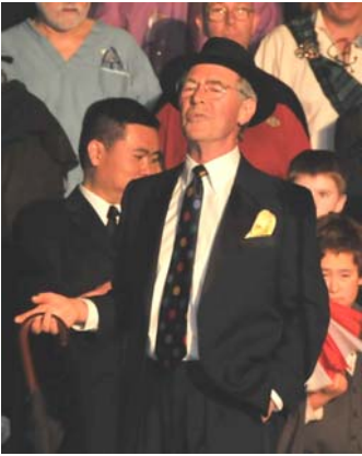
Moe (Gene Kelly) Jones