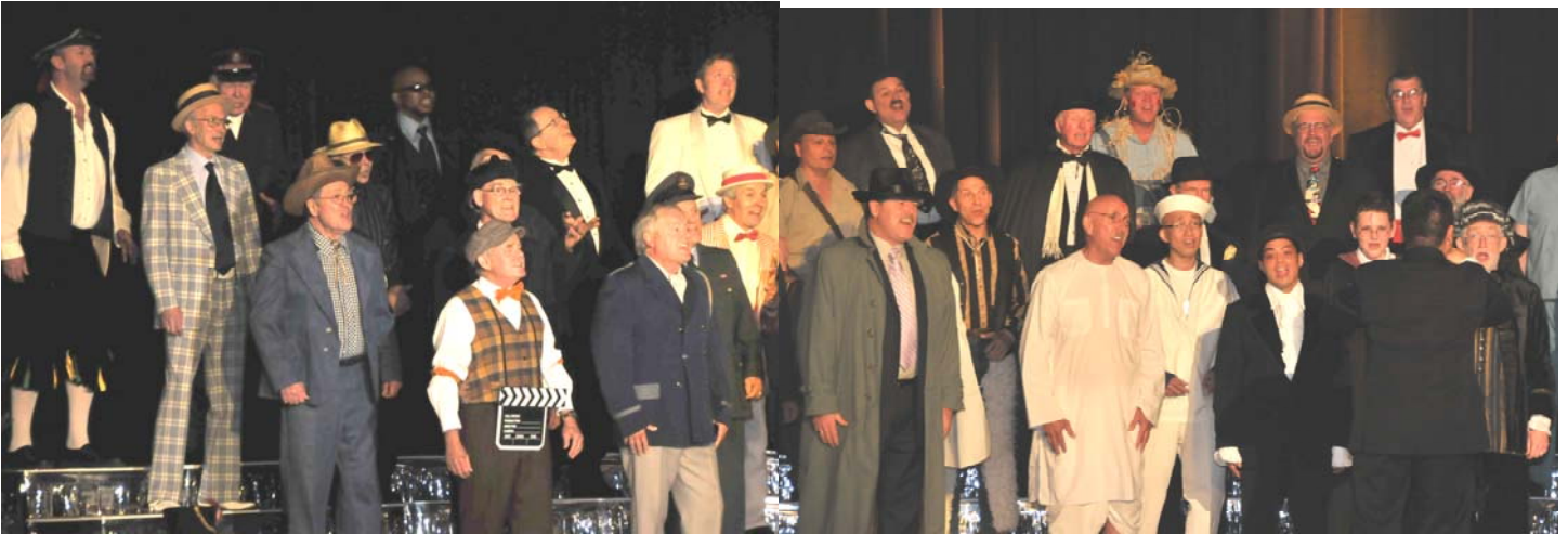
L to R: Baritones & Leads