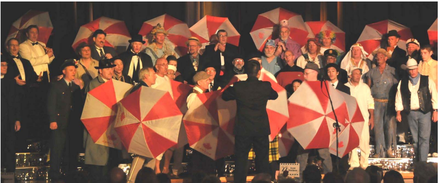
Singin' in the Rain