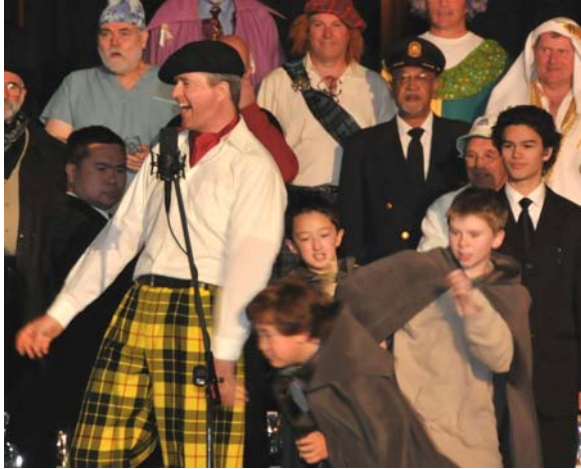
Hobbits on the Warpath