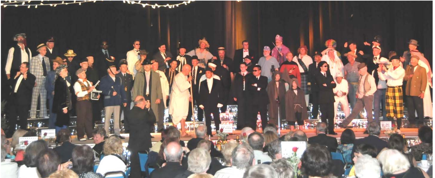
The Opening Pose