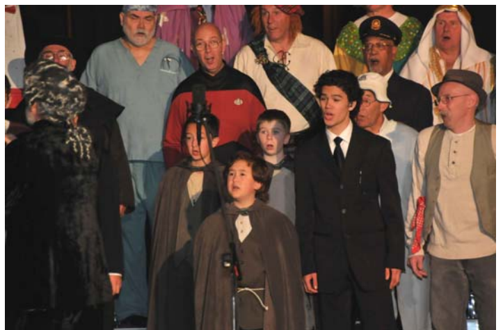
Thanks for the Memory