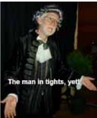
The man in tights, yet

The GoF Annual Spring Cabaret-Show-Silent Auction chose a subject rich in memorable music that spans the decades from the inception of sound in “ The Movies ”. The blend of picture, sound and music has become an integral part of our entertainment and our visual heritage and the GoF accepted the challenge of the Music of the Movies with enthusiasm.