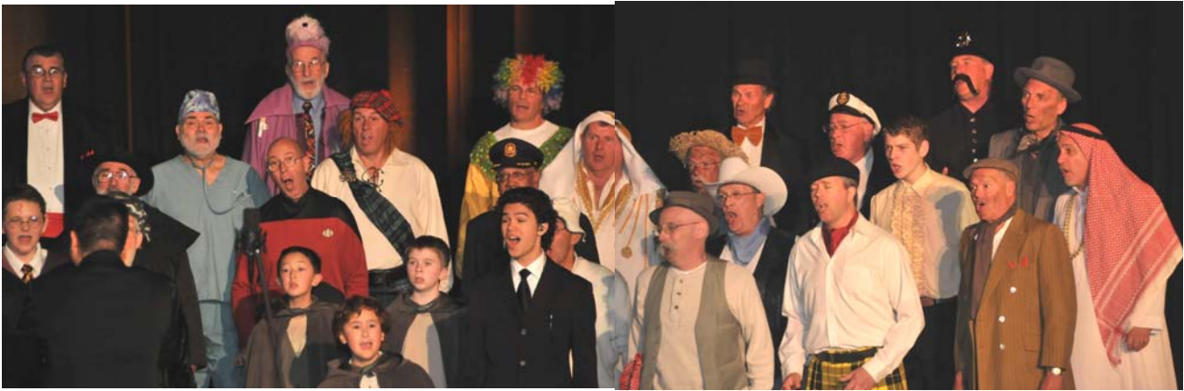
L to R: Tenors & Basses