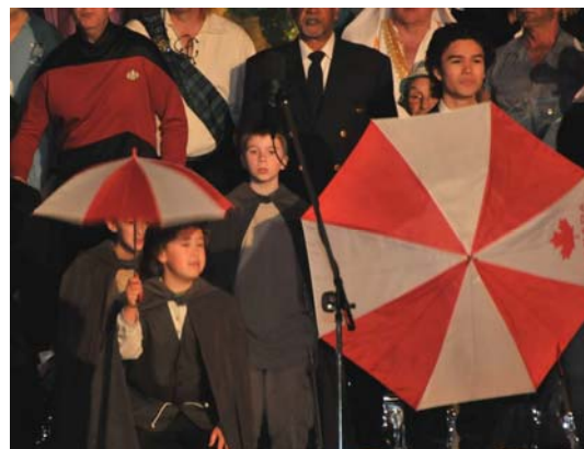
Hobbits get rained on too.