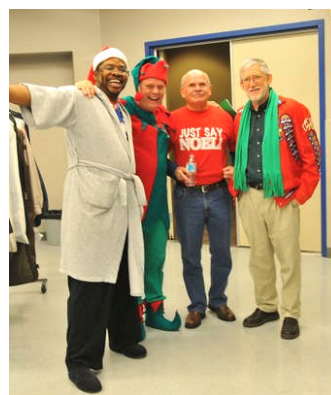
Show

Feb 12-28 Winter Olympics Feb 14 Valentine's Day Mar 12-21 Winter Paralympics