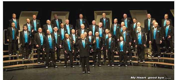
2010 Evergreen Division I Chorus Champions