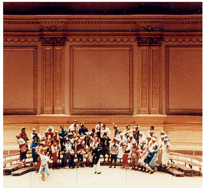
The GoF Wizard of Oz, Tuesday May 8, 1990 on stage in Carnegie Hall New York. The auditorium was awe inspiring and the stage absolutely huge with no curtains. The acoustics, however, were perfect.