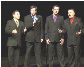
Vocal Works (2 nd )

2010 Quartet champs are The New Originals from Bellingham & Western Washington, with a revived Vocal Works (Vancouver) placing 2 nd and Abbots 4 third. The 5 quartets in the Prelims finals produced two International qualifiers: Catcher Block from FWD