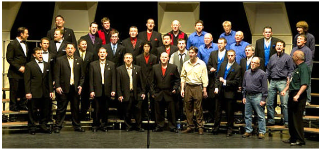
Division & Prelims "Quartet Chorus"

The 2010 Division I Convention included the District International Quartet Prelims. Held in Abbotsford on March 9/10 the contests were well hosted by the Vancouver Thunderbirds who took care of the District Board and Operations Team Meetings, as well as the chorus contest, the two quartet contests and Show of Champions, and the Afterglow.