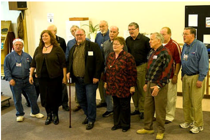
One of the VLQs from GoF, SAI and Langley

On Tuesday December 22 nd the GoF hosted an inter-chapter visit night at the Como Lake United Church. Joining the Gentlemen of Fortune were men from Vancouver Thunderbirds, Langley First Capital BBS Chorus, Abbotsford Voices of Harmony and Chilliwack Harmony Chorus; as well as the local Sweet Adelines Choruses. There were over 45 men and ladies on the risers for the warm up and mass sing finale.