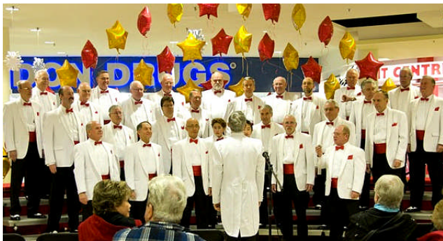
Sing out at the Loughheed Mall