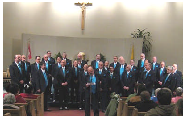
50/50 Show at Como Lake United Church