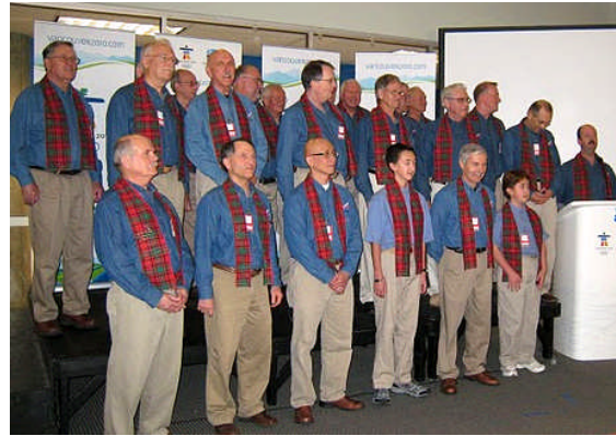
Sing out at Vanoc for the 2010 Winter Olympics Staff